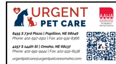
Magnet and Wallet Card