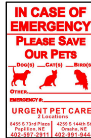
Save our Pets Window Cling