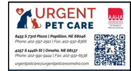
Magnet & Wallet Card