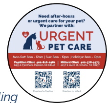
After Hours Window Cling