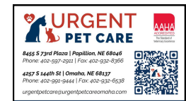
Magnet & Wallet Card